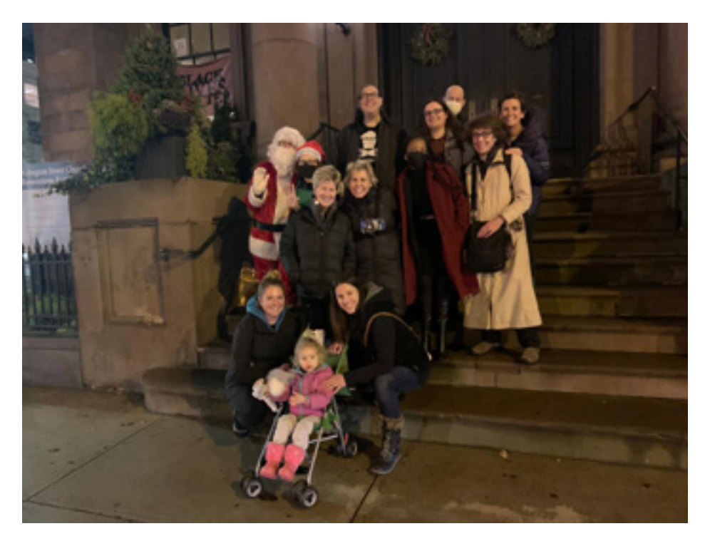
Group Two Heads Off to the Tree Lighting on the Boston Common