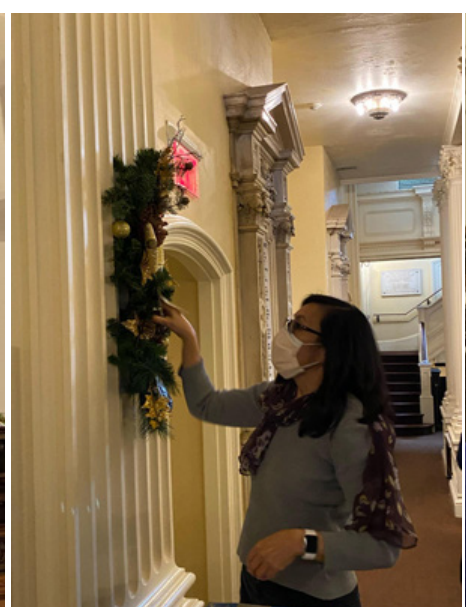
Kit zhuzhes the swag