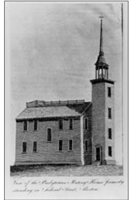
The Long Lane Meeting House, our home from 1844 - 1809.

In American life, few institutions can claim such distinction – an historic tradition that extends back a generation prior to the Revolutionary War! Even more significantly, an unbroken heritage of values and ideals remains at the core of what ASC is today – expressed in our motto, “gathered in love and service, for justice and peace.” Since its founding on November 15 th , 1729, our congregation has been a place of community and advocacy for the marginalized, the oppressed and the simply unconventional in the midst of very conventional Boston. Organized as one of the first non-Puritan churches in the city, by a group of Scottish “strangers”, this congregation has seemingly always been on the cutting edge of change and often in the vanguard of progressive religious and social reform. With the arrival of its most famous minister, William Ellery Channing, in 1804, the congregation became a leader in the development of liberal religion in America, and a major center in the birth of Unitarianism. In the 19 th century, ASC also firmly established the link between progressive theology and a liberal social vision.