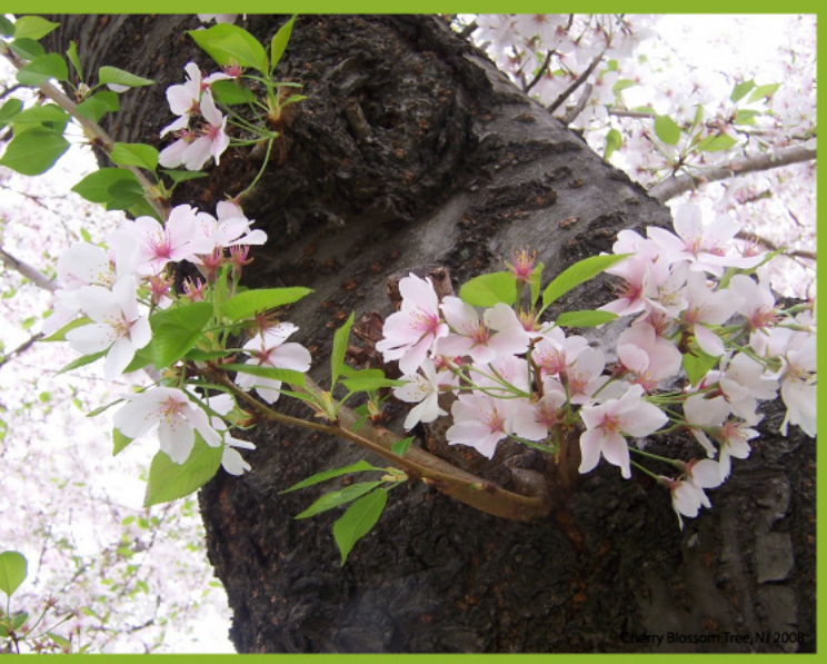
The earth is what we all have in common. Wendell Berry- Author, farmer, cultural critic 1934 -

NEW ORLEANS HIGH TEA SUNDAY ~ PALM SUNDAY ~ PATRIOTS DAY ~ EARTH DAY ~ BOSTON MARATHON ~ PASSOVER!