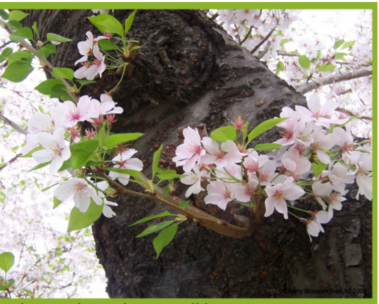
The earth is what we all have in common. Wendell Berry- Author, farmer, cultural critic

Arlington Street Church Boston, Massachusetts Founded in 1729 Gathered in love and service for justice and peace