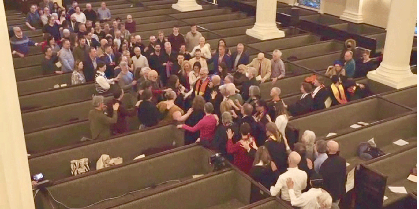
The Laying On of Hands