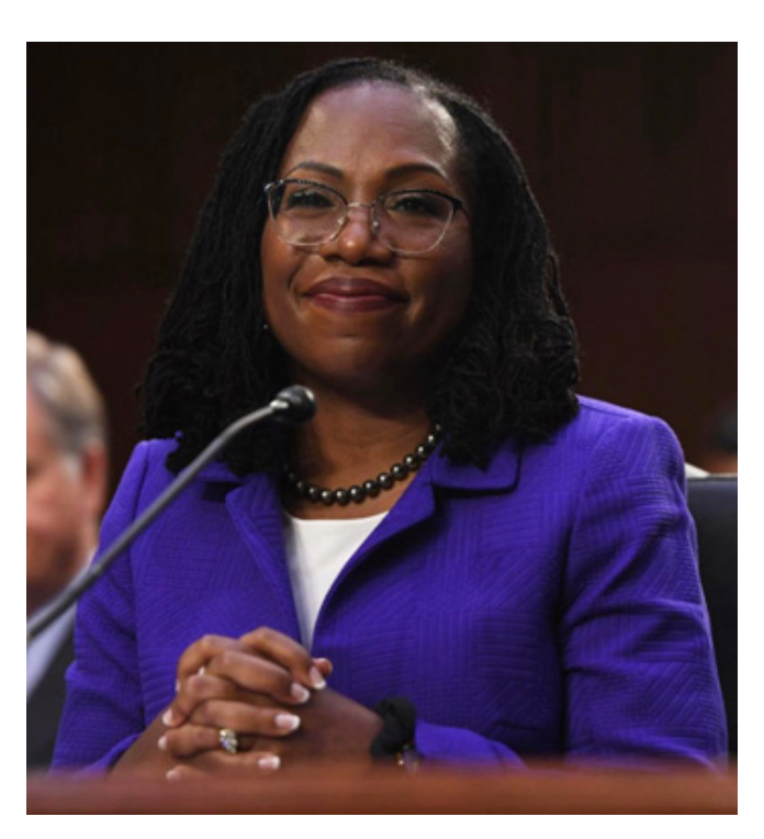
Supreme Court Justice nominee Judge Ketanji Brown Jackson