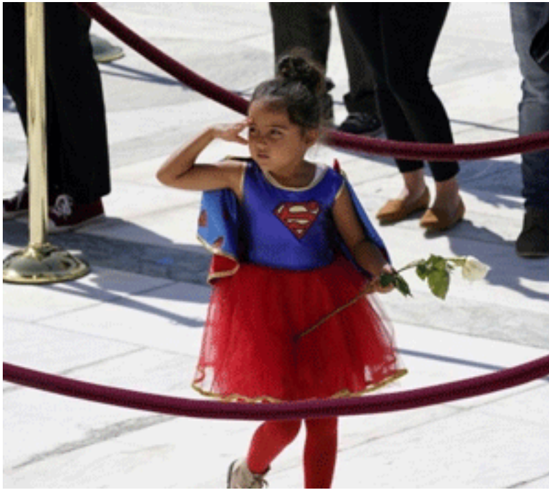
Supergirl pays her respects to RBG at the Supreme Court building on Wednesday.