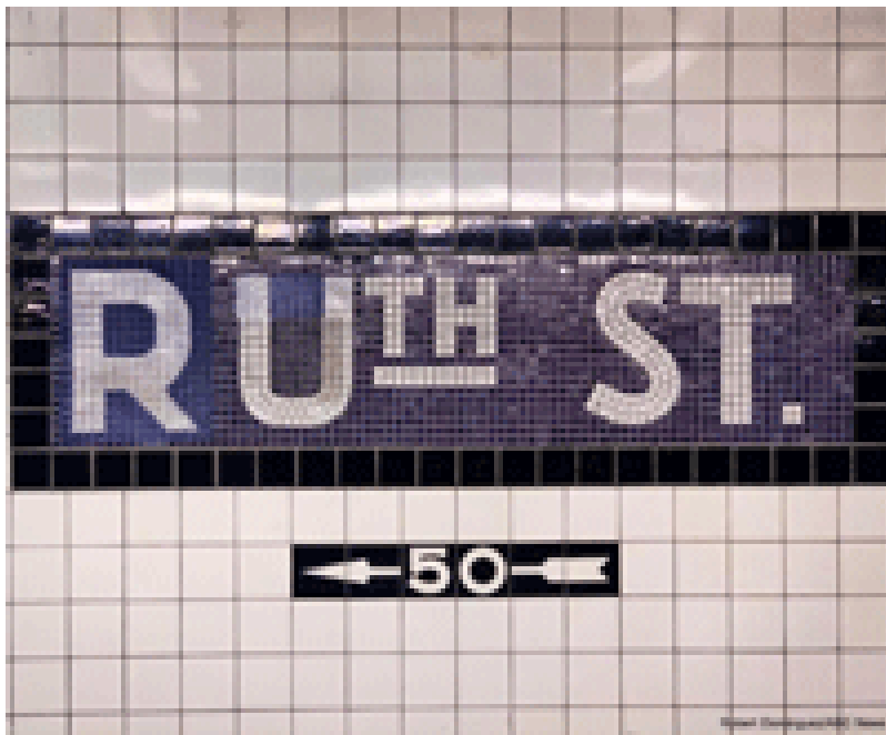
Overnight last Sunday, someone changed New York City's C train 50th street subway station into "Ruth Street" to honor the late Supreme Court Justice Ruth Bader Ginsburg.