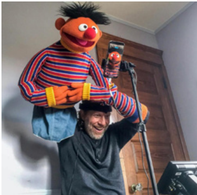
Muppets have been delivered to puppeteers' homes so Sesame Street can continue taping.