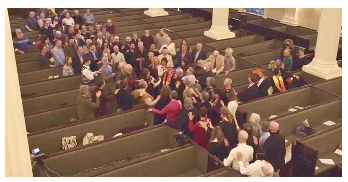
The Laying On of Hands