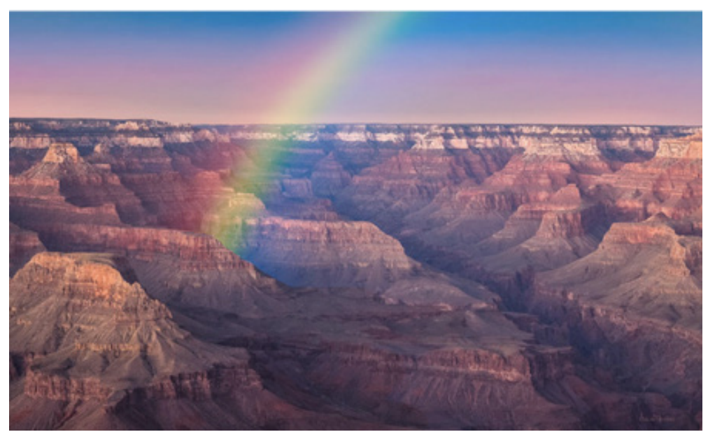
Rainbow Over Grand Canyon (photo credit: Ericamaxine Price) — another gift of the National Parks Service!