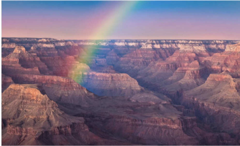
Rainbow Over Grand Canyon — another gift of the National Parks Service!