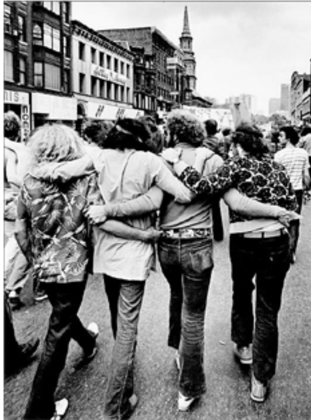
Boston's First Pride ~ June, 1970