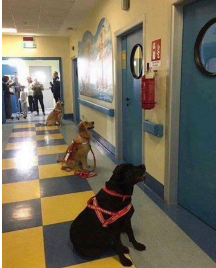
Service dogs (angels in disguise) waiting to enter hospital rooms to comfort and entertain patients.