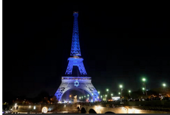
The Eiffel Tower ~ Paris, France