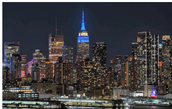
The Empire State Building ~ New York, NY