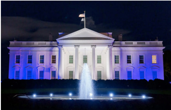
The White House ~ Washington, D.C.