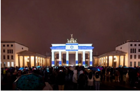
Brandenburg Gate ~ Berlin, Germany